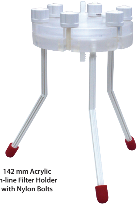
142 mm Acrylic In-line Filter Holder with Nylon Bolts

The Geotech Barrel Filter Holder is designed for on-site, manual filtration of surface or groundwater samples using a 0.45µm, 102mm diameter flatstock filter membrane. It is ideal for use in areas where a power supply is not available and in-line filtration is either impractical or impossible. Excellent option when standard, non-pressurized bailers are used for sample collection.