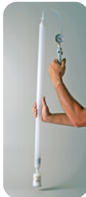
In-line filtration using the Geotech Hand Pump, pressurized bailer and dispos-a-filter™