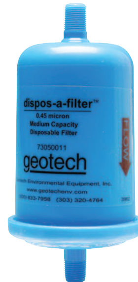
Geotech .45 Micron Medium Capacity dispos-a-filter™