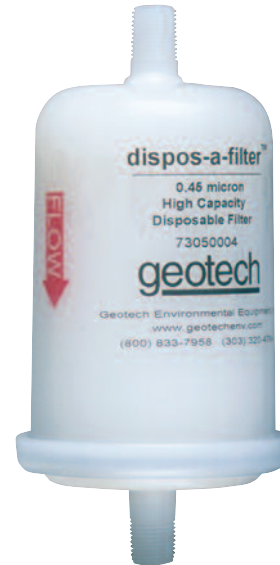
Geotech .45 Micron High Capacity dispos-a-filter™