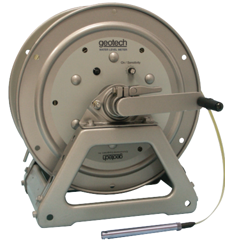
1500' (450m) Water Level Meter (manual rewind)