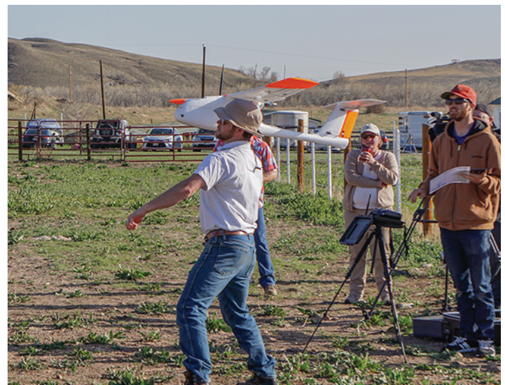
Available Flight Training