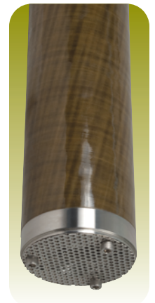
Bottom Fill with Flat Screen