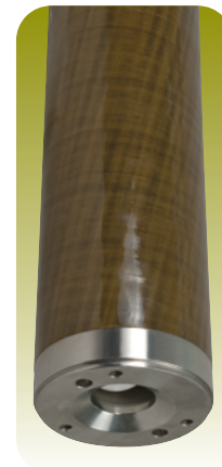
Bottom Fill with No Screen