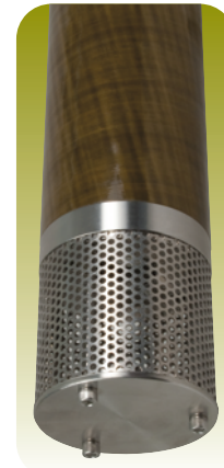
Bottom Fill with 3" (7.6cm) Screen