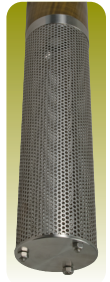
Bottom Fill with 12" (30.5cm) Screen