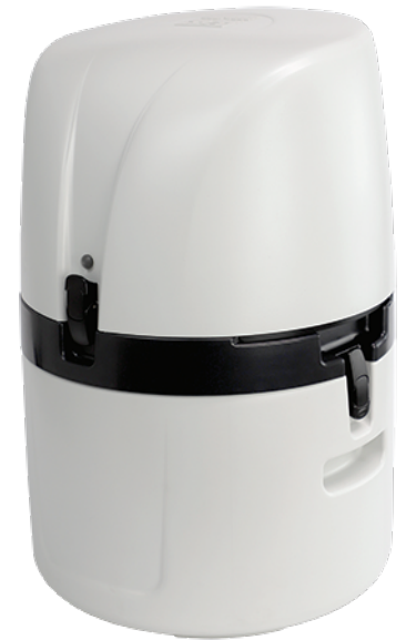
PM & PM-12