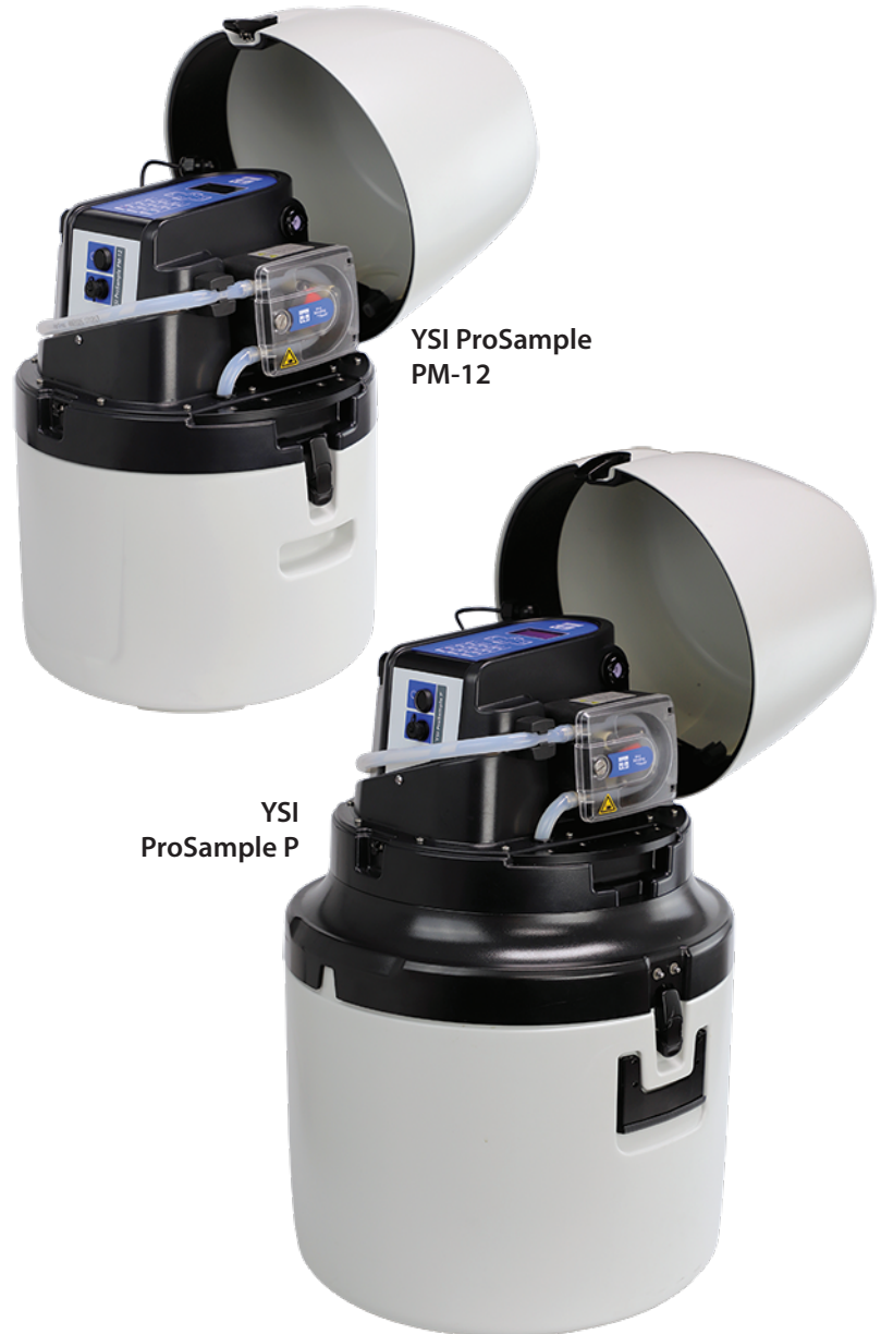
YSI ProSample PM-12