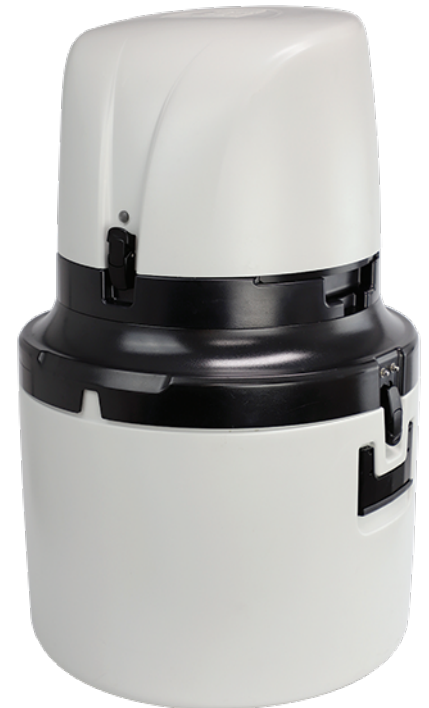
P & P-12