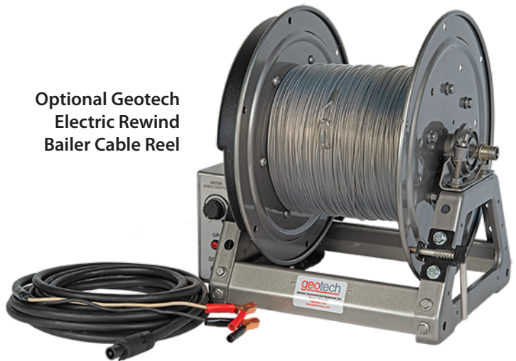
Optional Geotech Electric Rewind Bailer Cable Reel