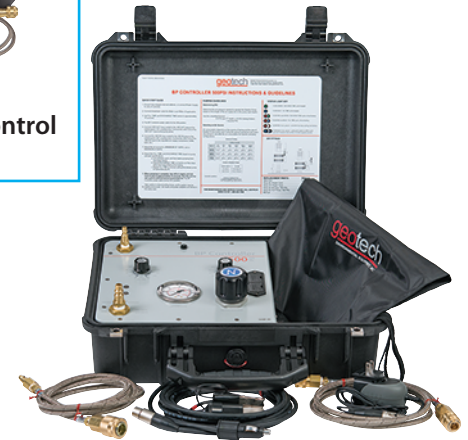
Geotech BP Controller 500 PSI