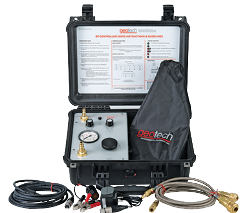
Geotech BP Controller 300 PSI