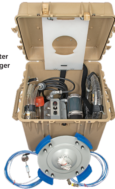
Large Diameter Filter Scavenger System

When approximately one liter of hydrocarbons collects in the buoy base, a float switch is activated, turning the pump on. Thus, water-free product is automatically pumped into a recovery tank. A water sensing switch is also located within the buoy. Should water enter the buoy, a density switch is activated, shutting off the pump and activating an alarm light. This automatic feature prevents recovered hydrocarbons from being contaminated by water.