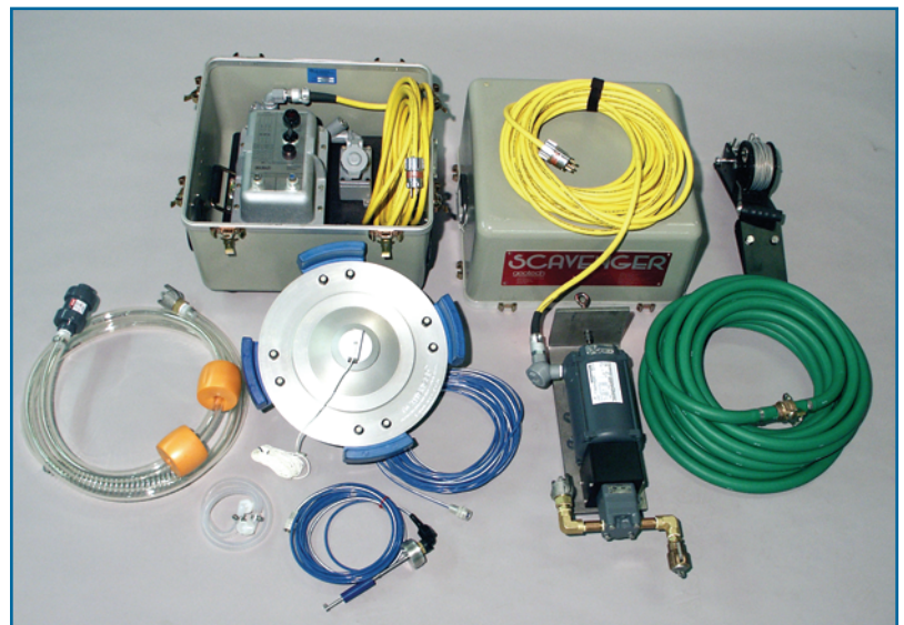
Large Diameter Dangle Scavenger system with optional case

When approximately one liter of hydrocarbons collects in the buoy base, a float switch is activated, turning the pump on. Thus, water-free product is automatically pumped into a recovery tank. A water sensing switch is also located within the buoy. Should water enter the buoy, a density switch is activated, shutting off the pump and activating an alarm light. This automatic feature prevents recovered hydrocarbons from being contaminated by water.