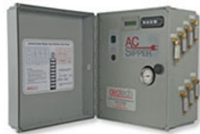
Control Panel and Pressure/Vacuum Pump (eight-well controller shown)