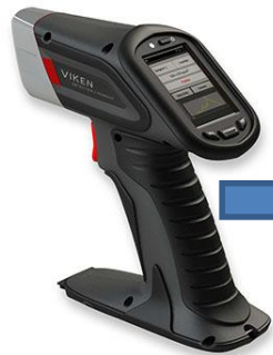
Viken Pb200i Lead Paint XRF