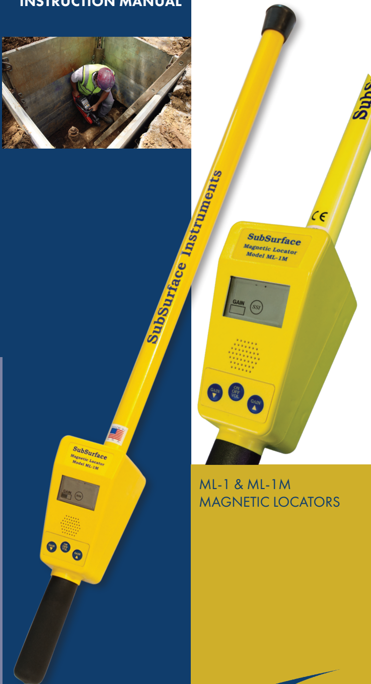
ML-1 & ML-1M MAGNETIC LOCATORS