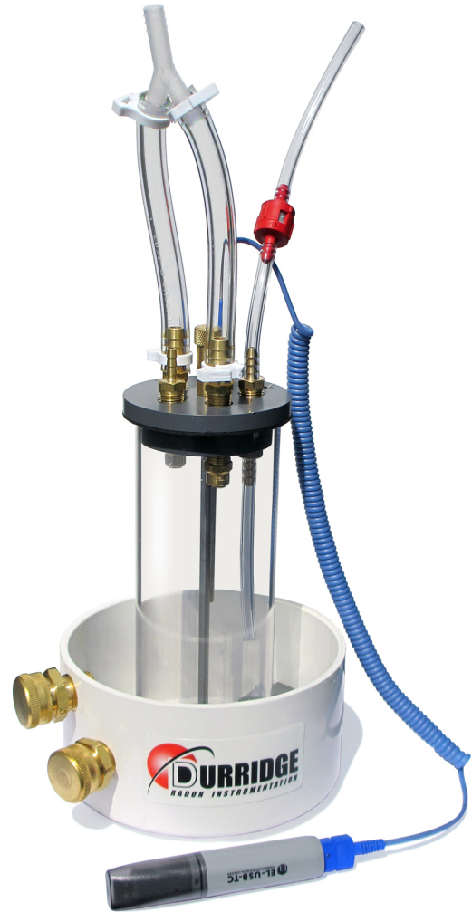
Fig. 1 RAD AQUA with Temperature Probe

The air return is sent, via the check valve, to the internal tubing that terminates halfway down the cylinder. The actual length of that internal tubing is not critical. If it is very short air would be able to short-circuit the exchanger without passing through the spray. If it were too long it may terminate beneath the internal water surface and may lose air through the water outlet. It should be about halfway down the cylinder.